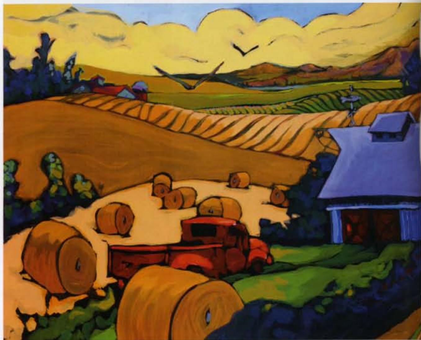
Connection 1 Left, acrylic on panel, 48 x 60"

Don Tiller uses simple shapes, vivid colors and strong line work to draw viewers into his dynamic contemporary landscapes. Tiller's latest body of work, titled Neighbors: the Connection Series , was inspired by a trip to France.