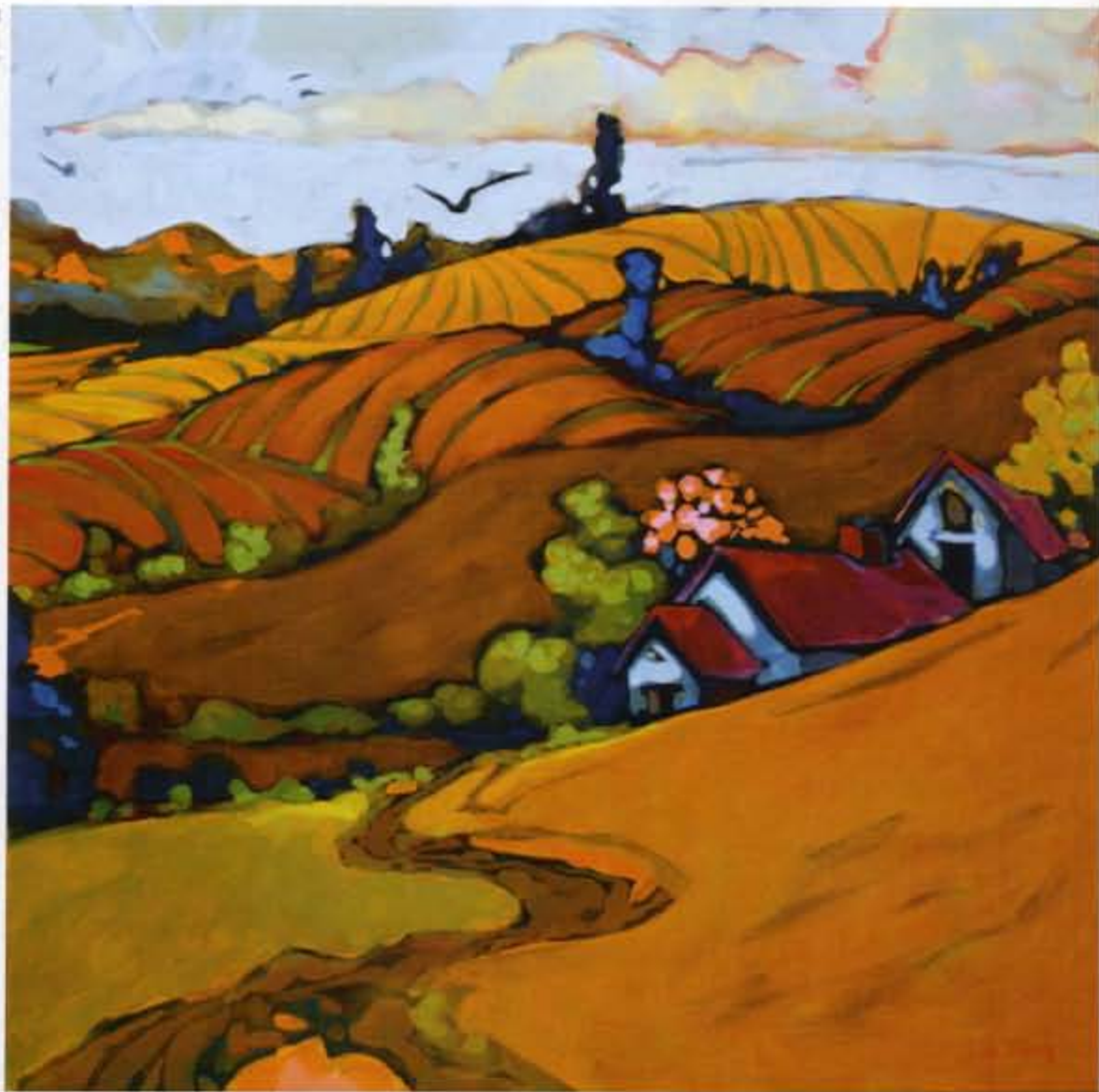
Connection 4 Right, acrylic on panel, 36 x 36"