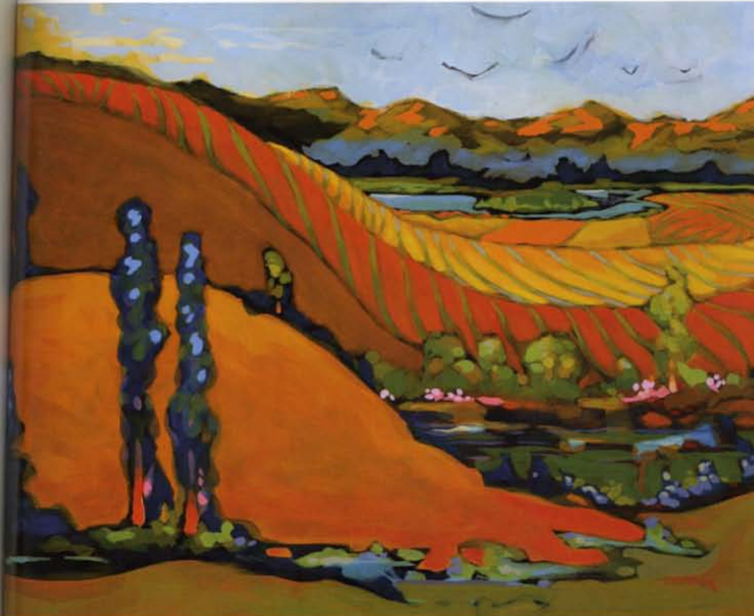
Connection 3 Left, acrylic on panel, 36 x 48"