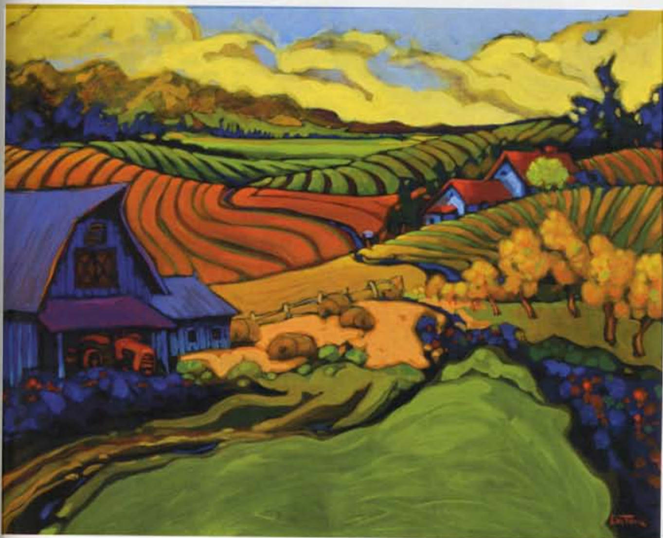
Connection 1 Right, acrylic on panel, 48 x 60"

—J.J. Jakubstin, Rive Gauche Art Galleries